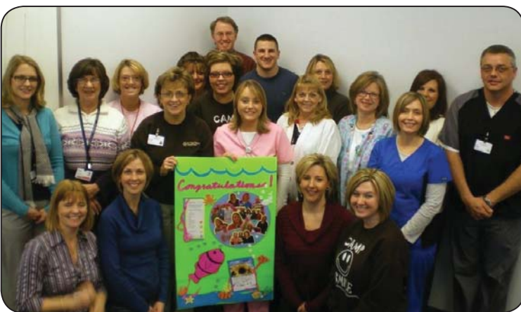
SCR Outpatient Center Staff take a moment for a group photo in recognition of their record number of appreciation cards for a quarter.