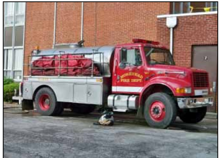
Morehead Firefighters provided clean water during the outage.

BOIL WATER RESTRICTION FOR HOSPITAL UNTIL MONDAY