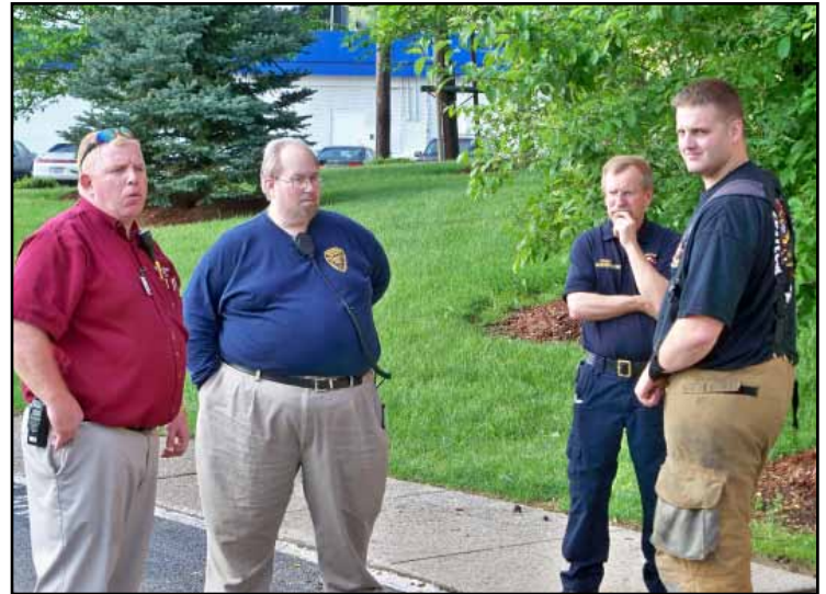
SCR Facilities Management and Morehead Firefighters work together to alleviate water issues.